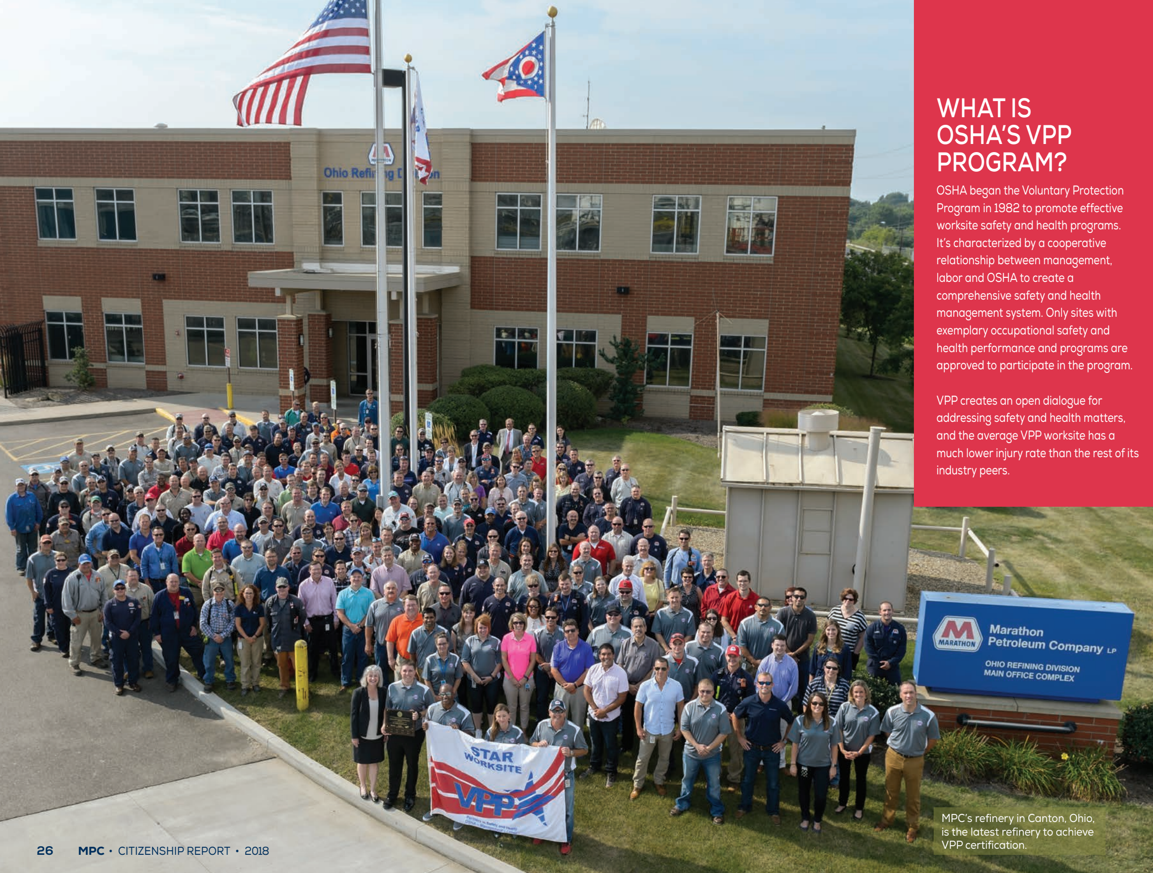
MPC's refinery in Canton, Ohio, is the latest refinery to achieve VPP certification.